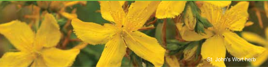
St. John's Wort herb

Serving Size: 1/4 tsp Servings/container: 2 oz. - 48 | 4 oz. - 96 Extracts from: Passion- flower leaf, Eleuthero root, Hops flower, St. John's Wort herb, Catnip leaf and flower, Skullcap herb. Other Ingredients: Vegeta- ble glycerin, distilled water, and approx. 5% organic grain alcohol. Sugg. Use: 1/4 tsp. in water 1-3 times daily or 1/4 tsp. 1/2 hour before bedtime. Additional info on page 81.