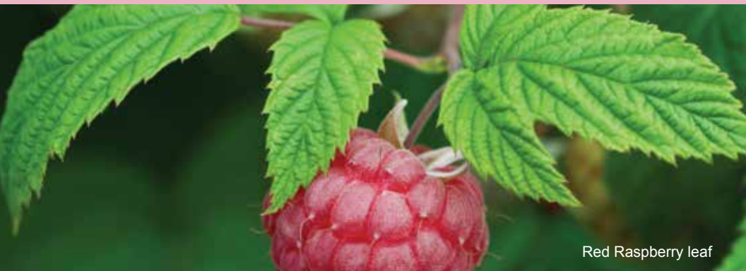
Red Raspberry leaf

Serving Size: 1/4 tsp Servings/container: 2 oz. - 48 | 4 oz. - 96 Extracts from: Blessed Thistle herb, Red Raspberry leaf, False Unicorn root, Partridge Berry herb, Blue Cohosh root, Ginger root, Skullcap herb, Motherwort herb, Wild Yam root, Bayberry root bark. Other Ingredients: vegetable glycerin, distilled water, and approx. 5% organic grain alcohol. Sugg. Use: During last 5 weeks of pregnancy: Week 1: 1/4 tsp. in water 2 times daily. Weeks 2-5: 1/4 tsp. in water 3 times daily.