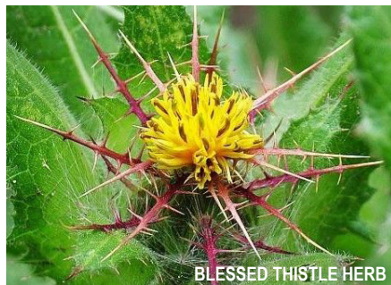
BLESSED THISTLE HERB

Blessed Thistle Herb is a medicinal herb traditionally used to support digestive health and promote liver function. It is believed to stimulate appetite, relieve indigestion, and help detoxify the liver by encouraging bile production. Additionally, blessed thistle has been used in herbal medicine to reduce inflammation, support immune function, and as a remedy for mild respiratory issues.