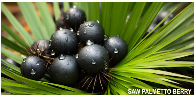
SAW PALMETTO BERRY