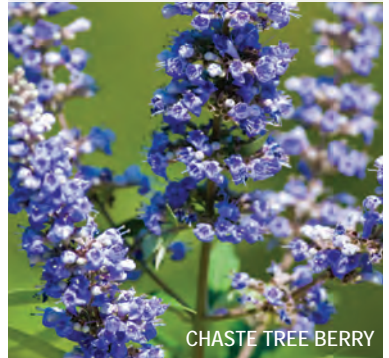
CHASTE TREE BERRY