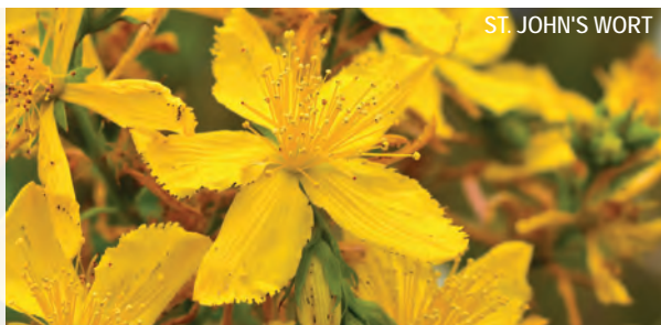
ST. JOHN'S WORT